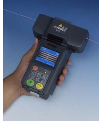
S121M Mass Fusion Model – Capable of splicing single fiber to 4-fiber ribbons. Can also splice up to 4 ribbonized fibers.