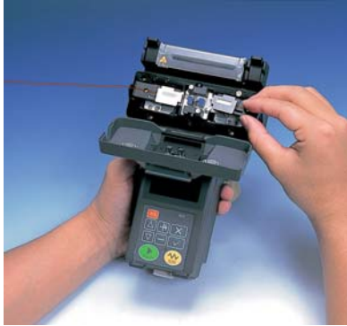
S121A Flagship Model – Uses fiber holder system for ease-of use.