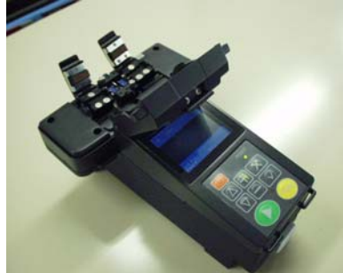
S121S Traditional Model – Uses traditional fiber clamps to feed fiber (250um and 900um fiber holders not required for operation). Fiber lid diameter is also reduced allowing for splicing with short fiber lengths