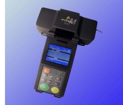
S121D Dual Fiber Version – Splices 2 single strand fibers simultaneously.